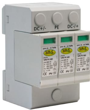
Part No. SPD PV600 600V DC

When we are looking protecting an installation against over voltage, we have to give some consideration to external cables entering the building. PV installations will come in to this bracket. SPD's for PV systems are to protect the inverter and the fixed installation, therefore PV SPD's should be installed on the DC side of the PV system, before the inverter. These will always be Type 2 devices, unless the building has an external lightning protection system and the correct separation distance to BSEN 62305-3 has not been maintained, where you would install a Type 1 SPD.