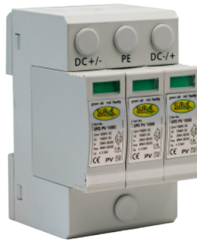
Part No. SPD PV1000 1000V DC